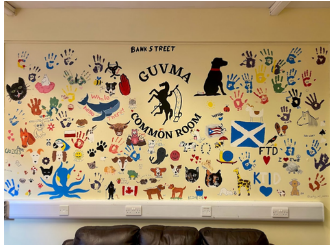
GUVMA Common Room Painting for Feel Good February