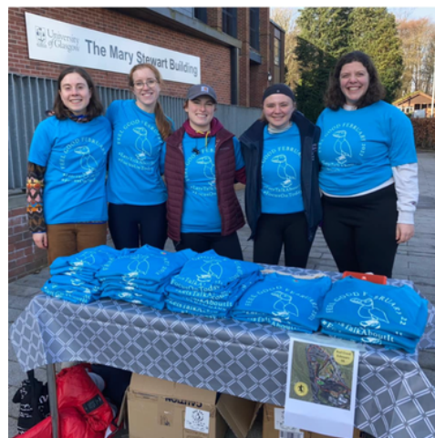
Feel Good February, 5k