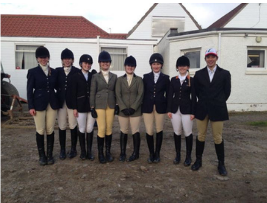
Our riding team represented at National finals this past summer!