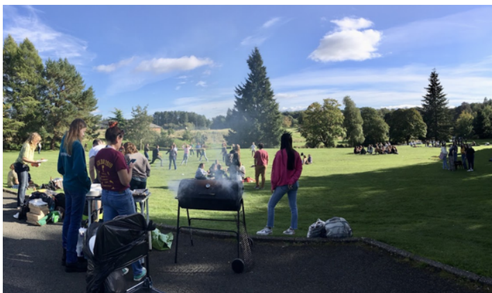
The Big GUVMA BBQ